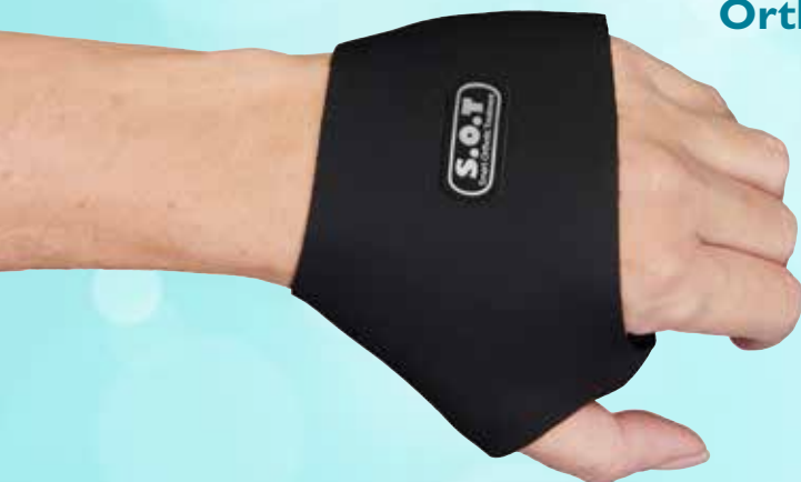
SOT Thumb Orthosis

In the same family we also proudly present the SOT Thumb orthosis. This product as well as the Resting Splint have an aluminium core that allows for shaping to fit the anatomy. Learn more in the videos that can be found on the website under product information.