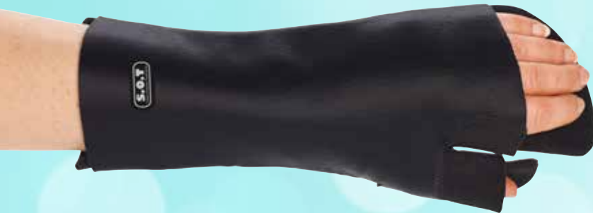
SOT Resting Splint

For this product various accessories are available such as Finger Divider, Wedge and Wrist Strap. To learn more about the use of SOT Resting Splint view the videos that can be found on the website under product information.