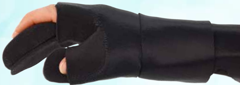
SOT Resting Splint with Wedge and Wrist Strap

In the same family we also proudly present the SOT Thumb orthosis. This product as well as the Resting Splint have an aluminium core that allows for shaping to fit the anatomy. Learn more in the videos that can be found on the website under product information.