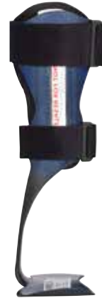
KiddieROCKER® Youth Sizes