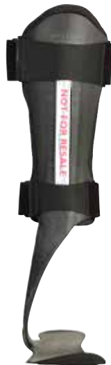
ToeOFF® FLOW 2½ ToeOFF® 2½ ToeOFF® 2.0