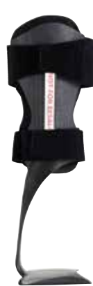
KiddieFLOW™ Youth Sizes

Allard also offers AFOs that are designed to be used as initial assessment tools to evaluate functional improvement, patient acceptance and as a gauge to decide which Allard AFO will work best for the patient as well as what modifications will be necessary to optimize the patient's gait pattern. Those are labeled "Not for resale".