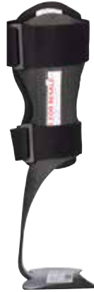
KiddieGAIT® Youth Sizes