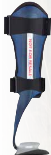
BlueROCKER® 2½ BlueROCKER® 2.0

Offered individually or in convenient "6-PACKS" (sizes small, medium and large – left and right).