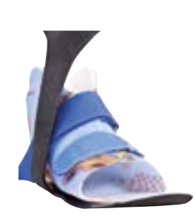
KiddieGAIT® with SMO

KiddieFLOW™, KiddieGAIT® and KiddieROCKER®should always be combined with an additional orthotic, designed to control the position of the foot.