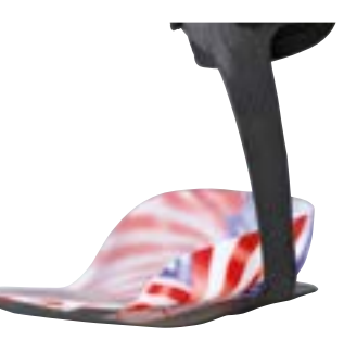
KiddieGAIT® with UCB