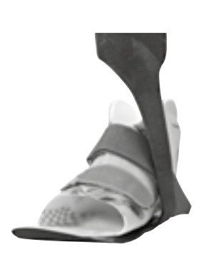
KiddieGAIT® with Surestep™