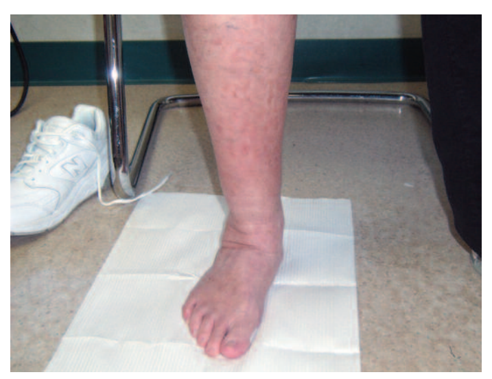
Figure 2. Patient weight bearing, anterior view. Notice marked increase in forefoot eversion, with knee compensated to hyperextension.

This local support can be provided by a biomechanical foot orthotic device. The device will need to be firm enough to control abnormal motions occurring secondary to both ground reaction (bottom up) and external (top down) forces being driven through the foot. Designs and materials will depend on the grade of the PTTD, with more rigid control being required as the degree of PTTD increases.