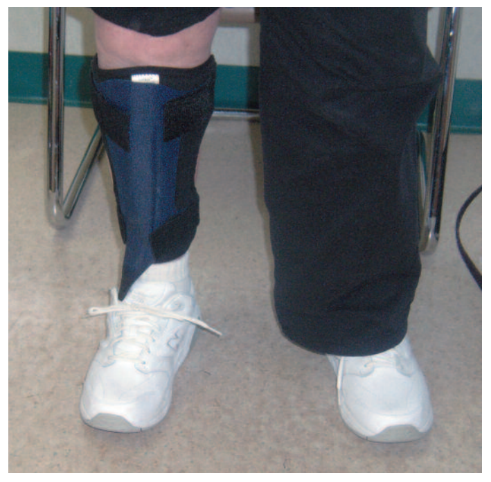
Figure 4. Patient weight bearing, anterior view, with finished FRECO Blue rocker and New Balance walking shoe to aid in third rocker function. Noticed improved forefoot, ankle and knee alignment in stance.

References are available at www.lowerextremityreview.com