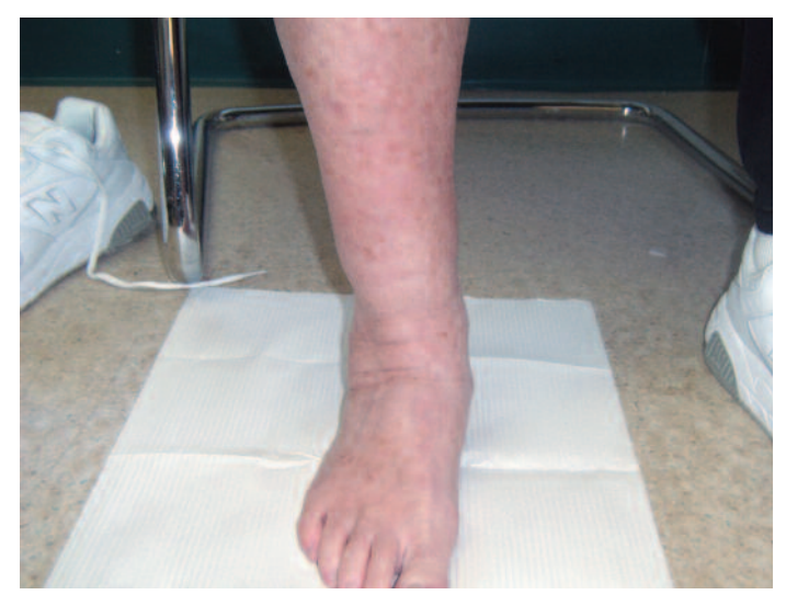
Figure 1. Patient non weight bearing. Anterior view showing Grade 3 PTTD, with subtalar joint swelling and forefoot eversion. (The same patient is featured in all figures.)

tibia progresses over the fixed foot, thereby providing additional decelerating effect of pronatory forces and preparing the foot to reposition into supination for more effective and efficient propulsion during the third rocker. So loading and unloading of the posterior tibialis muscle occurs earlier and later in the closed chain phases of gait when the foot engages the ground and again when it leaves the ground. It is the only dual-phase muscle in the plantar flexor group.