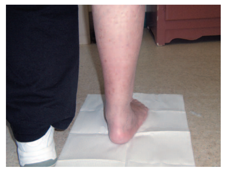
Figure 3. Patient weight bearing, posterior view. Notice increased edema at the Achilles tendon insertion point, too many toes sign common with PTTD Grade 3, and lack of a plantar grade heel, indicating tight Achilles tendon.

For stage I, one could reason that a relatively firm prefabricated foot orthotic shell device would be enough to minimize excessive motions and stresses.<sup>11</sup> For stage II, custom semi-rigid control would be more appropriate. For stage III, a fully functional (rigid) biomechanical foot orthotic device or UCB could be justified to control the stresses that lead to the injury. Finally, for a fixed stage IV, a more accommodative device would be appropriate to conform to the deformity and allow support with maximum pressure distribution on soft tissue.